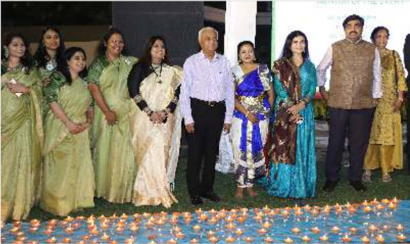
'Ganga- Ghat Diya Aarti personified in GLS Campus'