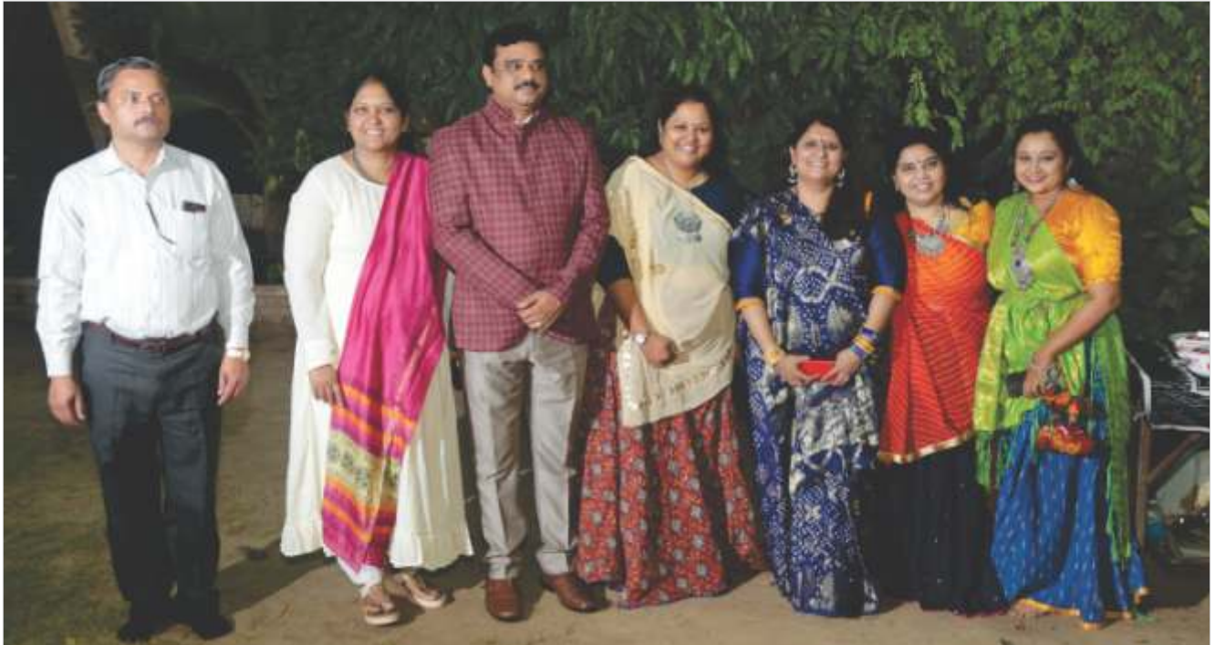
Ready for praying Adyashakti in Grand Garba Celebration of GLS Law College

Navratri is a Hindu festival which is celebrated in autumn every year all over India in different ways. In Gujarat, during Navratri people perform Garbas on devotional songs that are popularly known by the names of 'Dandiya Raas' and 'Garba Raas', to please the Goddess and receive her blessings. So, the students and the faculty members of GLS Law College celebrated Navratri on 1st October, 2019 with full zeal and enthusiasm.