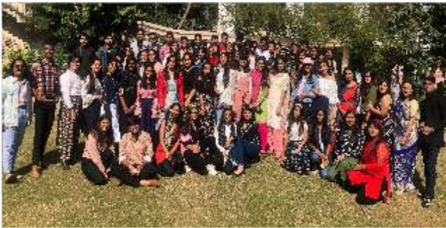
United - We celebrate....

With the enthusiasm of the students of GLS Law College, the Fun Week was celebrated from 26th December 2019 to 31st December 2019 arranged by the student union. Fun days like Retro Day, Bollywood Day, Halloween Day and Super Ideal Day were celebrated. Students enjoyed 'The GLS Life' along with developing skills like Group Coordination. Students got an exposure to show the hidden talent in form of activities. Each day had a unique dress code like traditional dress, Bollywood inspired dress, etc. the last day was celebrated as a Signature Day in order to have the college memories inked.