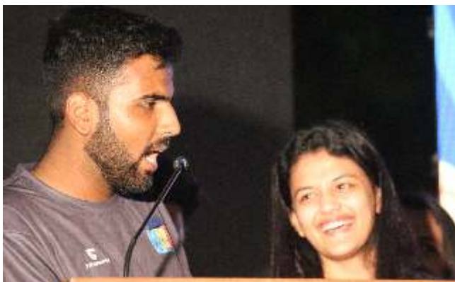
Convener and co convener beaming happily