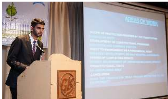
Youth at Technical Session at International Conference

ISSN-3582-5402 GLS Law Journal first issue launched on June 30, 2020 with the purpose to publish worthy articles on different spheres. Best 10 articles will be published in first two values of the journal.