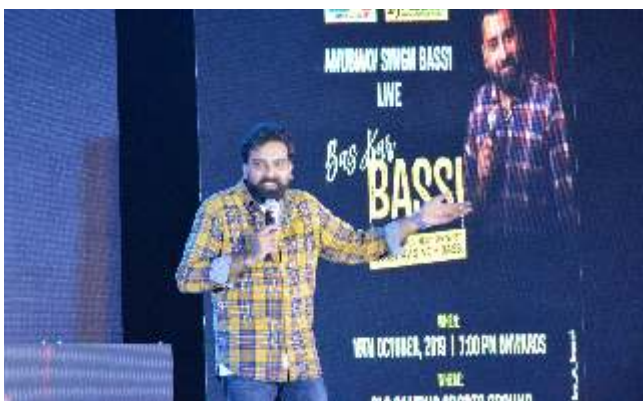
Bas 'mat' karo Bassi