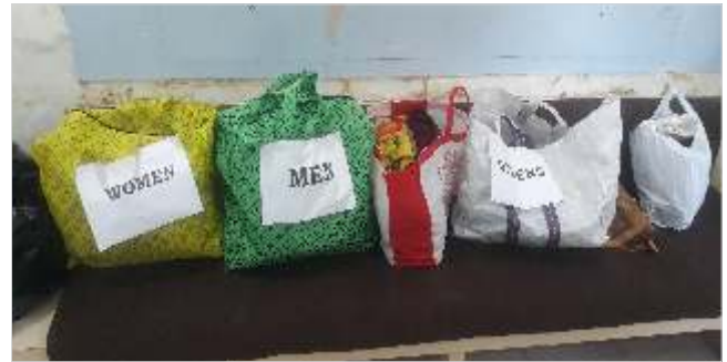
The pleasure of "Giving"

With the enthusiasm of the students of GLS Law College, the Fun Week was celebrated from 26th December 2019 to 31st December 2019 arranged by the student union. Fun days like Retro Day, Bollywood Day, Halloween Day and Super Ideal Day were celebrated. Students enjoyed 'The GLS Life' along with developing skills like Group Coordination. Students got an exposure to show the hidden talent in form of activities. Each day had a unique dress code like traditional dress, Bollywood inspired dress, etc. the last day was celebrated as a Signature Day in order to have the college memories inked.