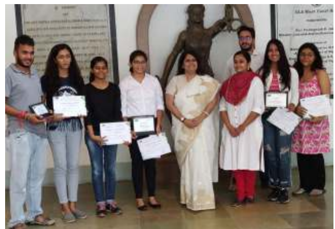
Image Competition Proud winners with mentors

The students of GLS Law College secured the 2nd Runners up trophy over all in Arthshastrosav.