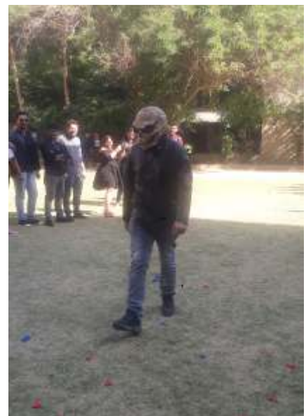
Come December with traditional days and fun games