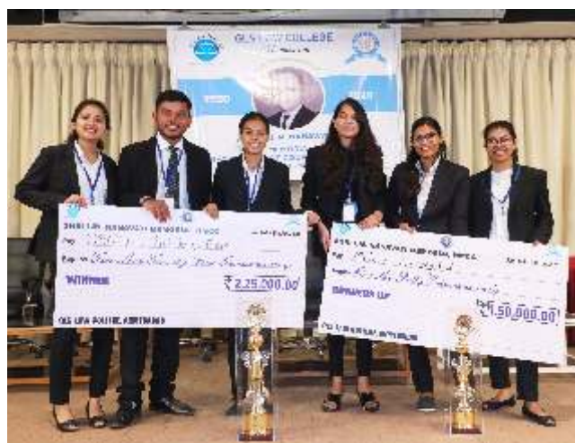
Winners receiving Cash Prize