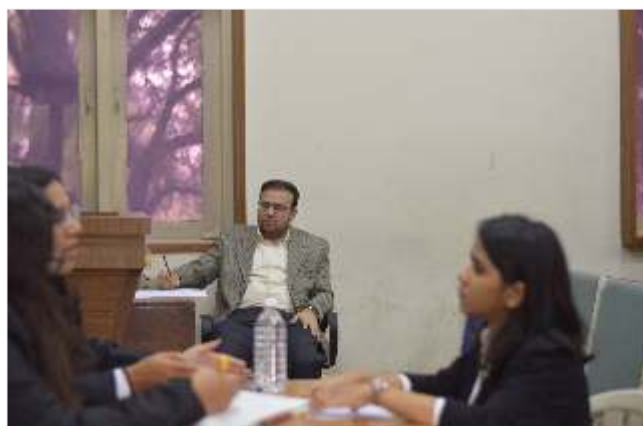
Negotiating with Discussion