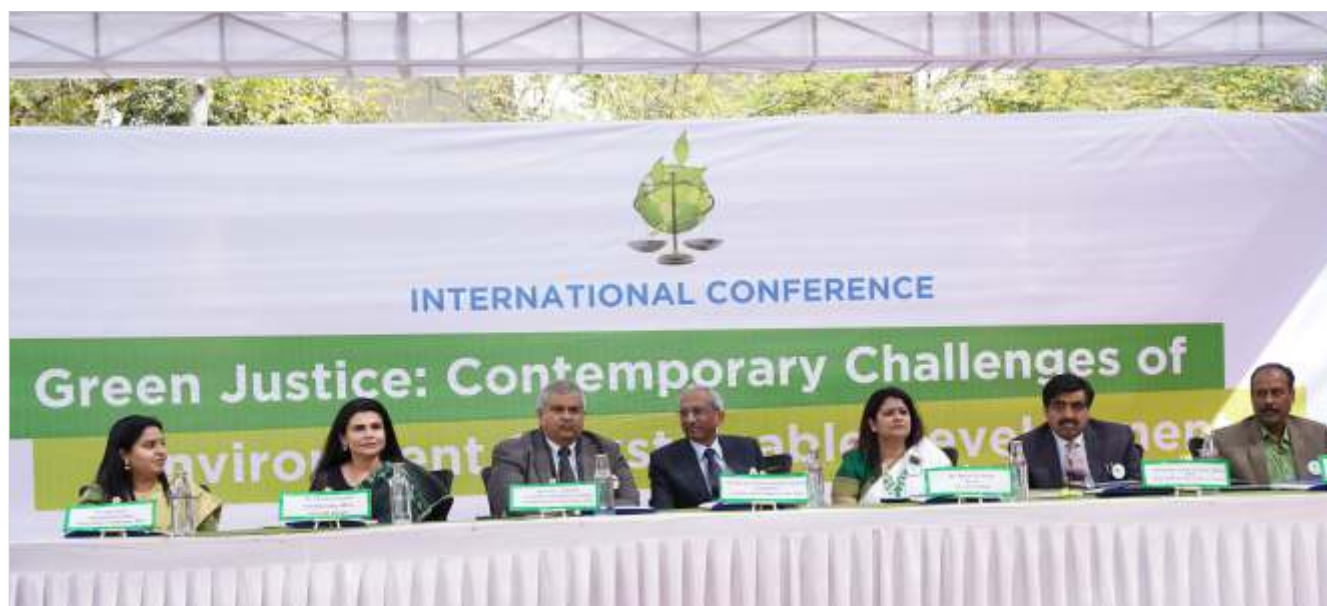
Industrial Pollution Needs to be Curbed to Protect Environment: Justice Goel

GLS Law College organised an international conference on Green Justice: Contemporary Challenges of Environment and Sustainable Development on February 29 and March 1, 2020.