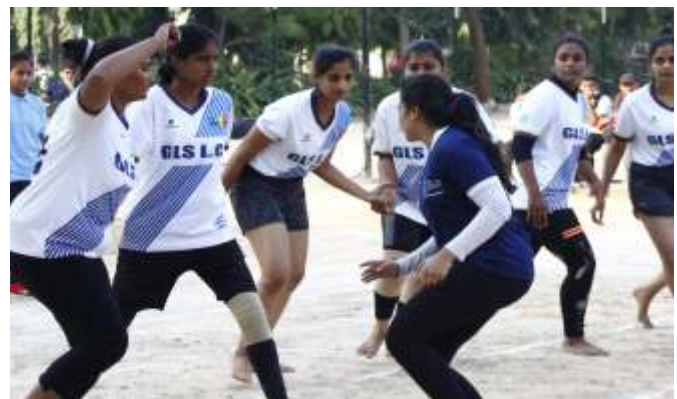
'Pulling Leg' is fun @ Kabaddi