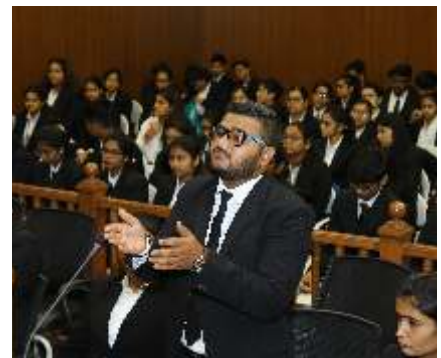
Young Mooters in Action