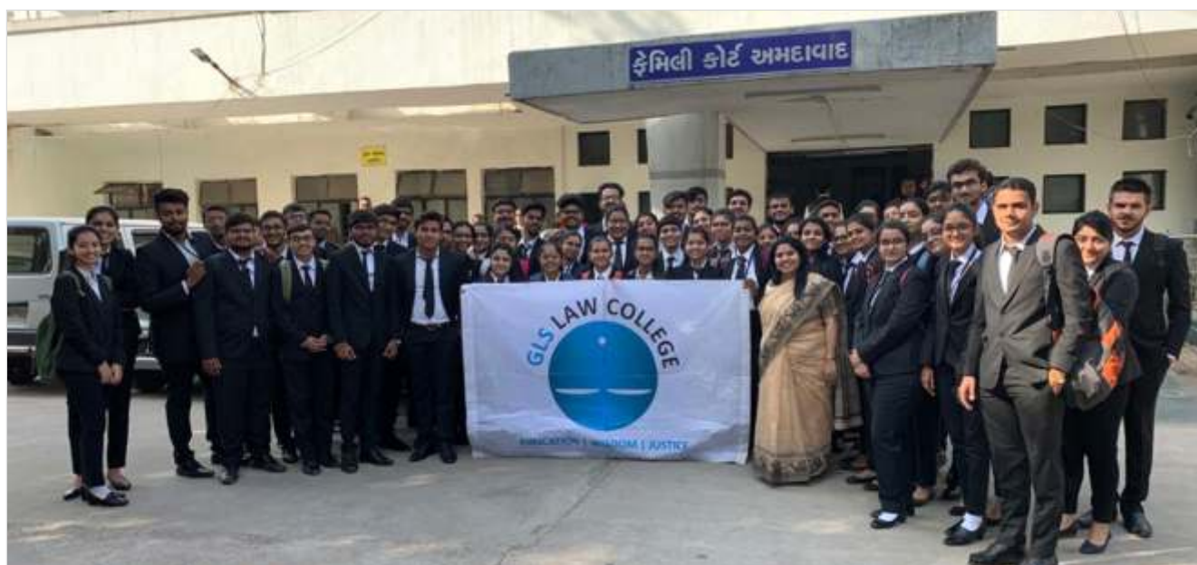
Worth Visiting Day @ Family Court

The students of Semester 4 were taken to a Family Court visit on the days, 19th and 20th December, 2019. This visit was not only a part of an internal assessment but was also a medium by which the future lawyers and judges were exposed to the actual functioning of the courts. Since the expansive field of law is a 'touch and feel' endeavor, this Family Court visit helped the students unravel their latent inclinations and helped them discover their true aptitude. The students made various observations and derived accurate conclusions by witnessing the proceedings of the court first hand. This entire exercise of self-learning facilitated by GLS Law College and undertaken by the students, truly