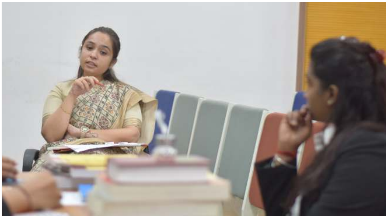
Counselling Before Client Counseling

GLS Law College introduced 'Client Counselling Competition' on January 4, 2020 for grilling the negotiation skills of students. In which 5 Teams comprising of 2 students in each team from each semester had participated. The areas of law on which the cases were based upon was Contract Law, Criminal Law, Constitutional law, Property Laws, Family Laws, Environment al Laws, Intellectual Property Rights.