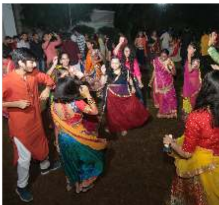
Khalaiyas of GLSLC