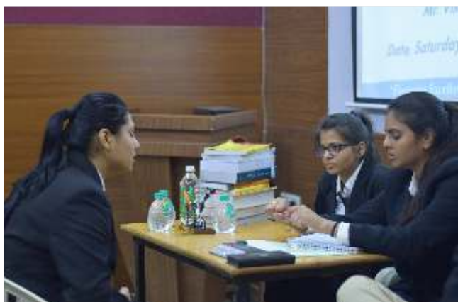
Counselling in Action