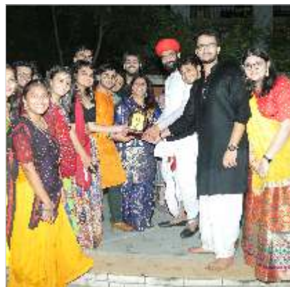
Winners in happy mood