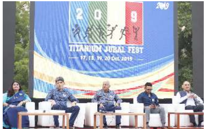
Titanium Valedictory Function