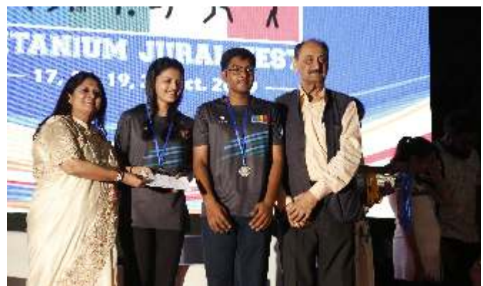
Proud 'Winning Duo' in Badminton @ Titanium