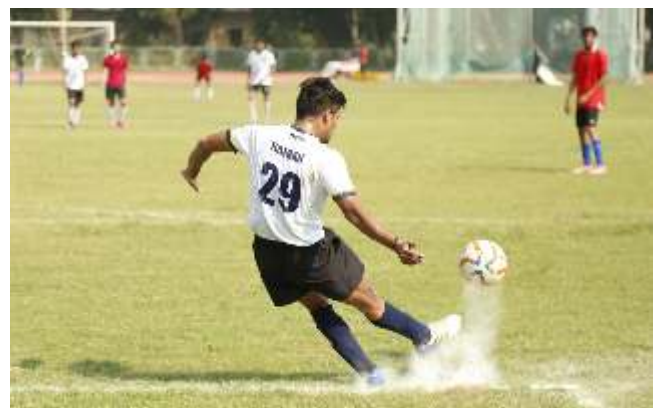
Go Go Goal !!!