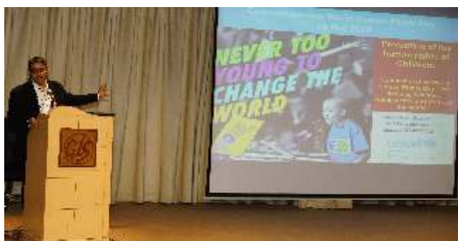
Short Movie made by students