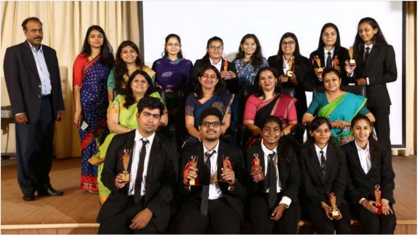
Winners with Judges in Happy Mood

As someone rightly said great design comes from free interaction, conflict, arguments, competition and 'debate.' To shape the argument skills of budding lawyers, the Thought Republic at GLS Law College organized Intra college debate competition. The preliminary round was conducted on 22nd July, 2019 with topic 'Man Proposes, Law Disposes; #ManTooMovement. The top 18 from preliminary round were selected for final round which was conducted on 26th July 2019 in Asian Parliamentary