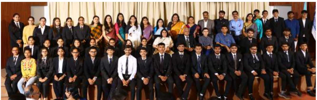
Full Family with Induction of Fifth Batch @ GLS Law College