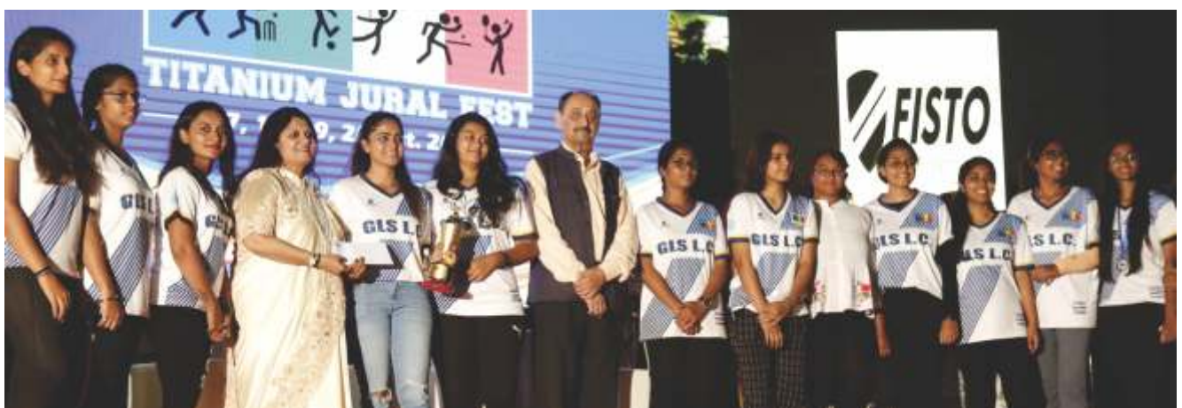
Voracious winners of Titanium