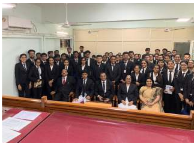
Inside the Courtroom