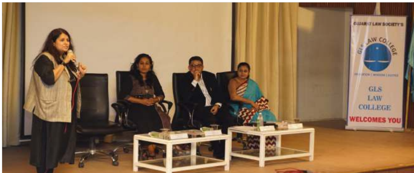
International Human Rights Day Celebration

Every year the International Human Rights Day is celebrated at GLS Law College with a Rotating Trophy. In the year 2019-2020, the competition was in the form of 'Short film making' on the topic: "Tribute to Gandhi's Human rights Ideology". The activity was to pay tribute to one of the greatest philanthropists to ever exist and to his words when he said "In times to come people will not judge us by the creed we profess or the label we wear or the slogans we shout, but by our work, industry, sacrifice, honesty and purity of character." His words reflect beyond doubt that he upheld and wished for all, basic human rights, irrespective of irrelevant considerations of caste, creed, religion, etc. The duration of the film was to be of 3 minutes, with the winning semester bagging the Rotating Trophy.