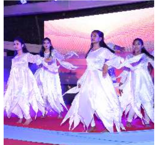
Waves of river GANGA on stage

"Nothing that is worth having, ever comes to one, except as a result of hard work." The grand success of the cultural program at the Green Justice: International Conference 2020 wouldn't have been possible without the hard work and dedication of each member of Gujarat Law Society.