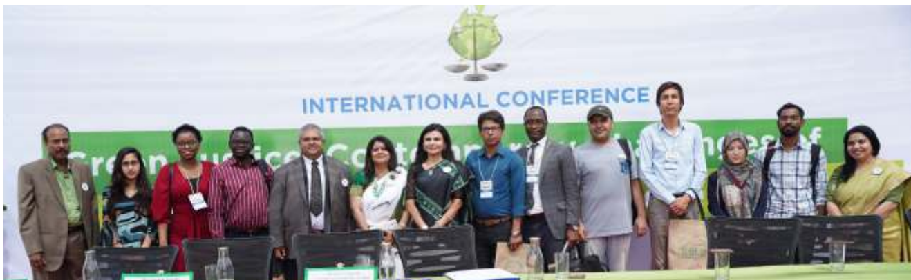
Guests get greener at International Conference