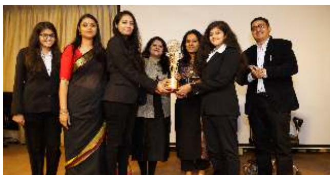
Winning Semester in Movie making