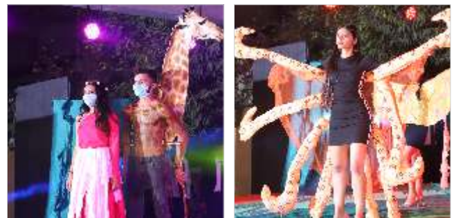
Spectacular Performance by students of GLS Law College