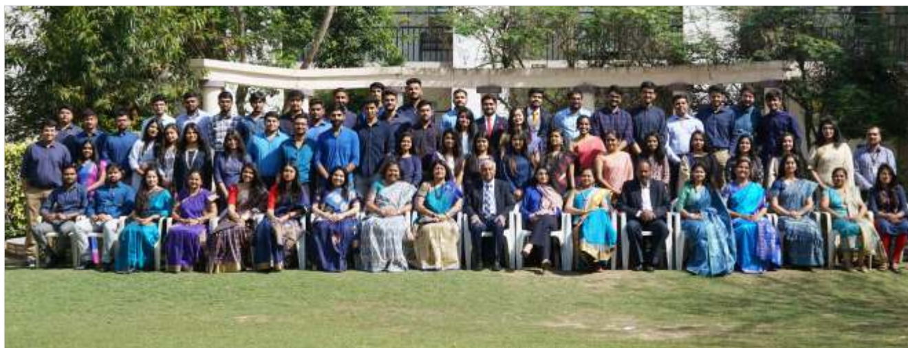
Farewelling the First Batch

Overall, it was the morning of mixed emotions for all present at the function to witness the official send-off for the 2015 batch students and a day of fiesta devoted to the years spent together with friends and teachers to reminisce joyous moments.